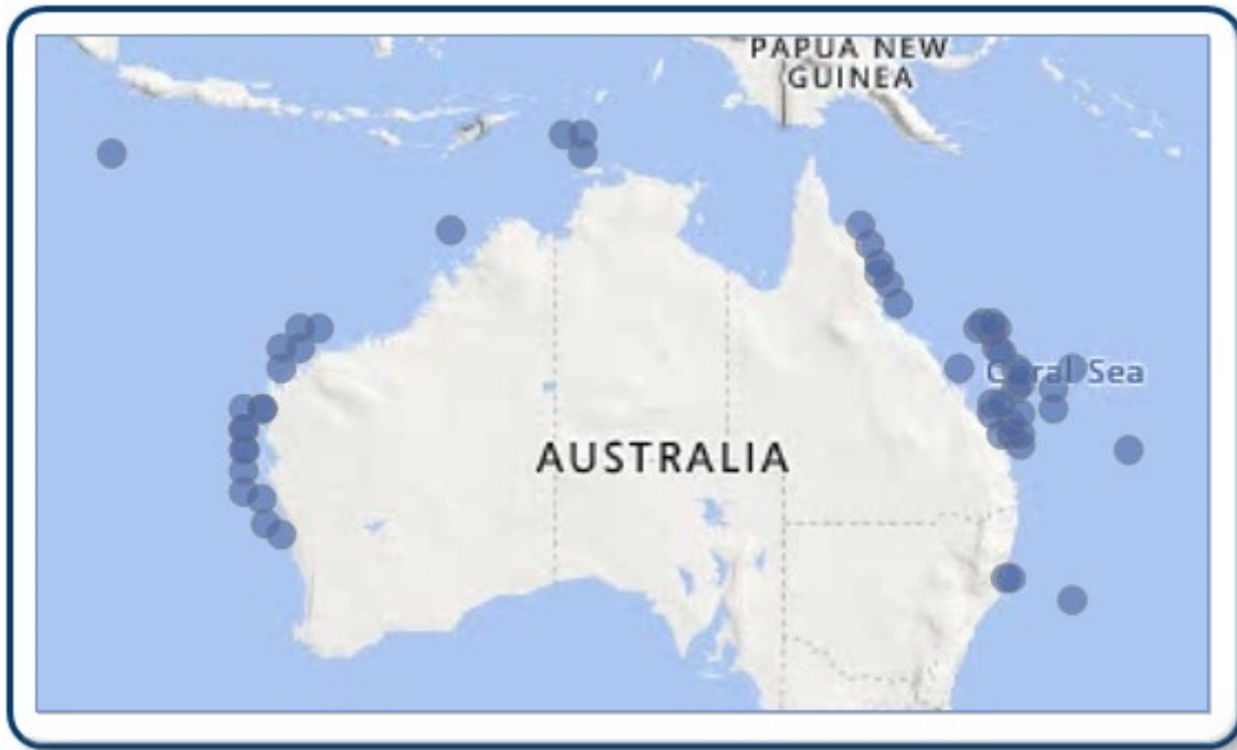
Distribution of reported commercial catch of Ruby Snappers